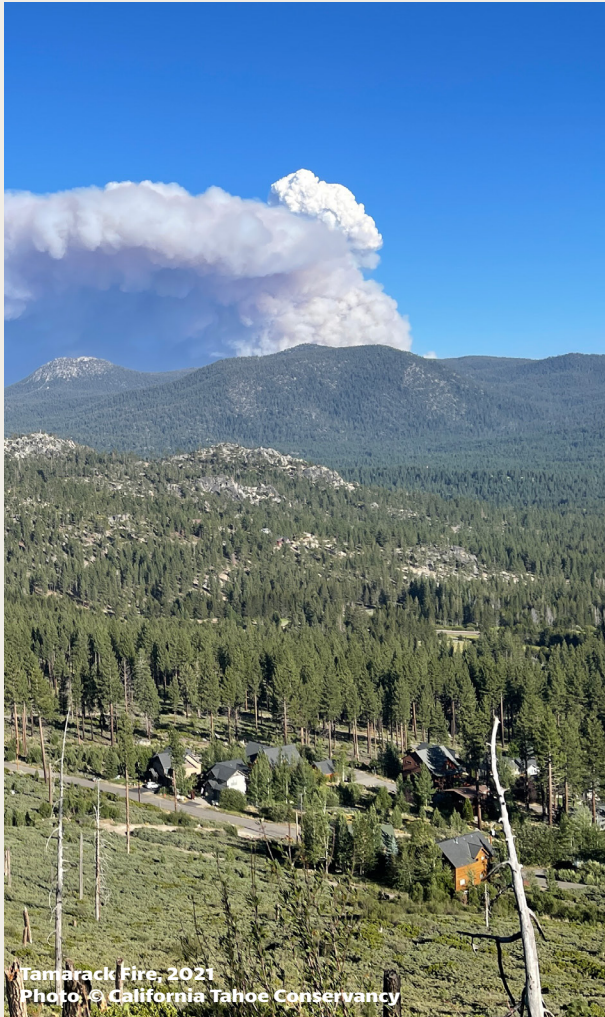
Tamarack Fire, 2021